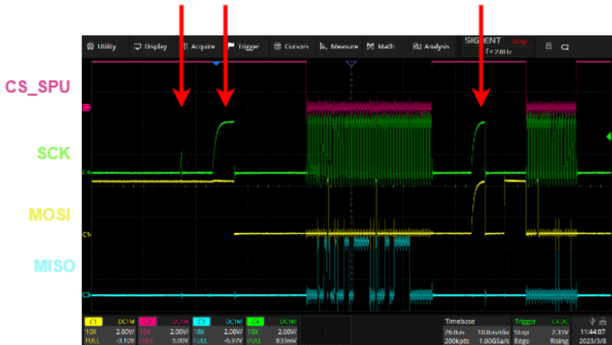
Figure 1. SPI bus traces are contaminated by a floating SCK signal when no chips are selected. The three red arrows highlight areas where SPU-001 TC2 is affected.

This becomes a problem if another chip sharing the SPI bus communicates with the host MCU using a protocol where bits are sent in non-multiples of 8, or if the SCK signal floats when chips are not selected. An example of the latter is given below. The three red arrows show where the host allows the SCK signal to float while the CS signal is not asserted (logic high). This behavior causes the SPU to lose synchronization in a way that is difficult to recover from without a hard reset.